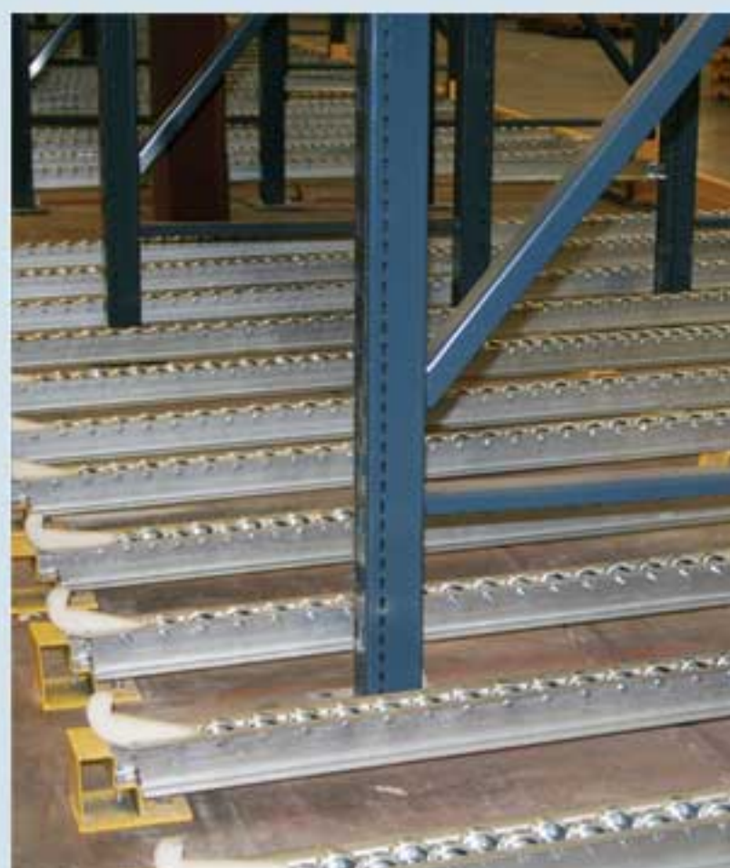
Pallet Flow Rack