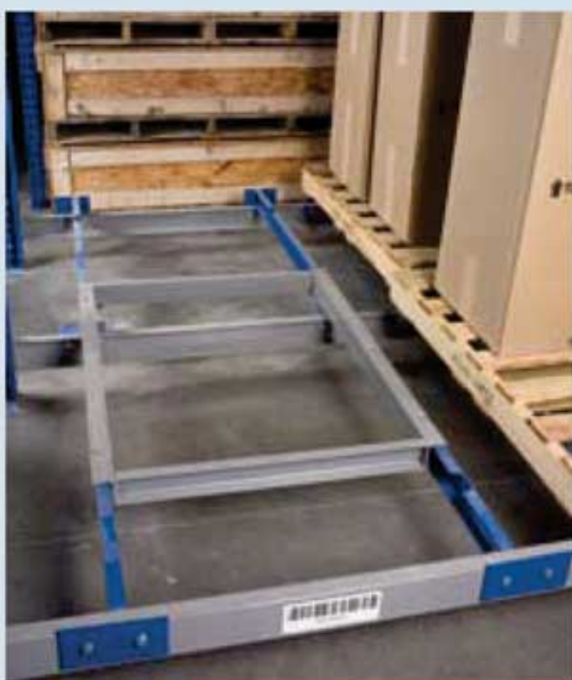
Push Back Rack