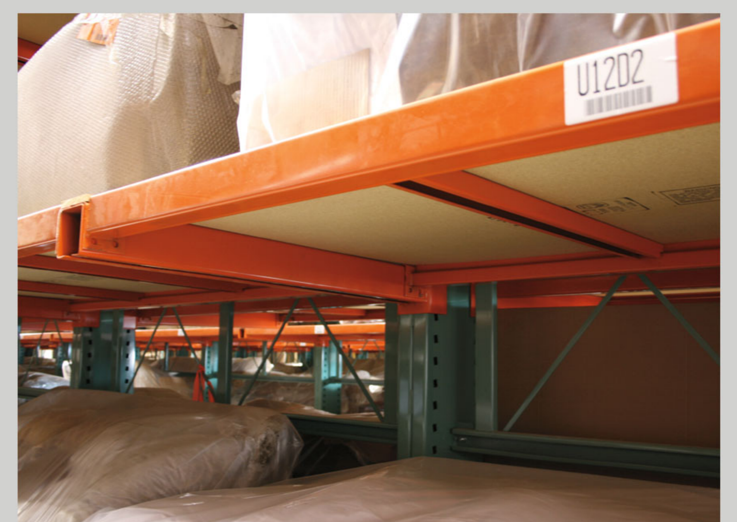
Support beams can be designed for wood or wire decking placement