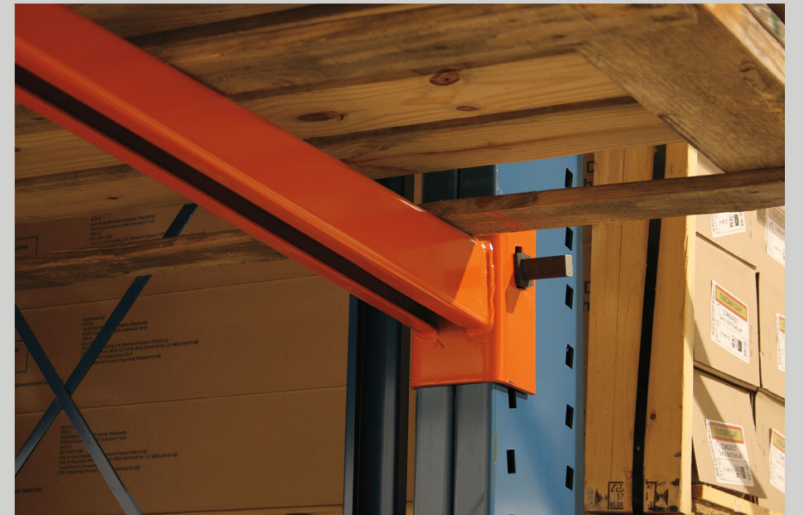
Tapered arms are adjustable on 3" increments

UNARCO's solid one-piece column design with completely welded column to base construction is rigid, stable and easy to install.