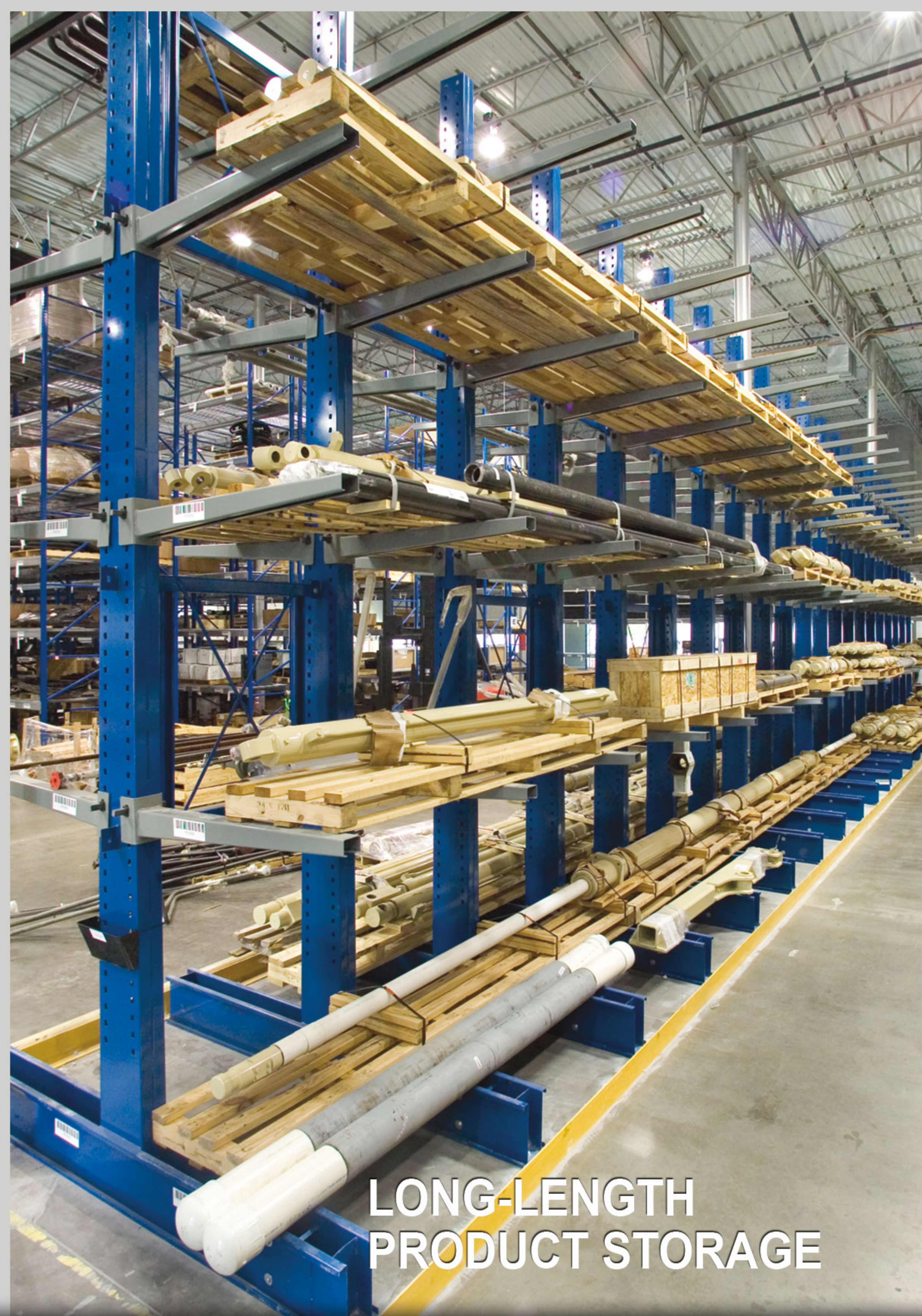
LONG-LENGTH PRODUCT STORAGE