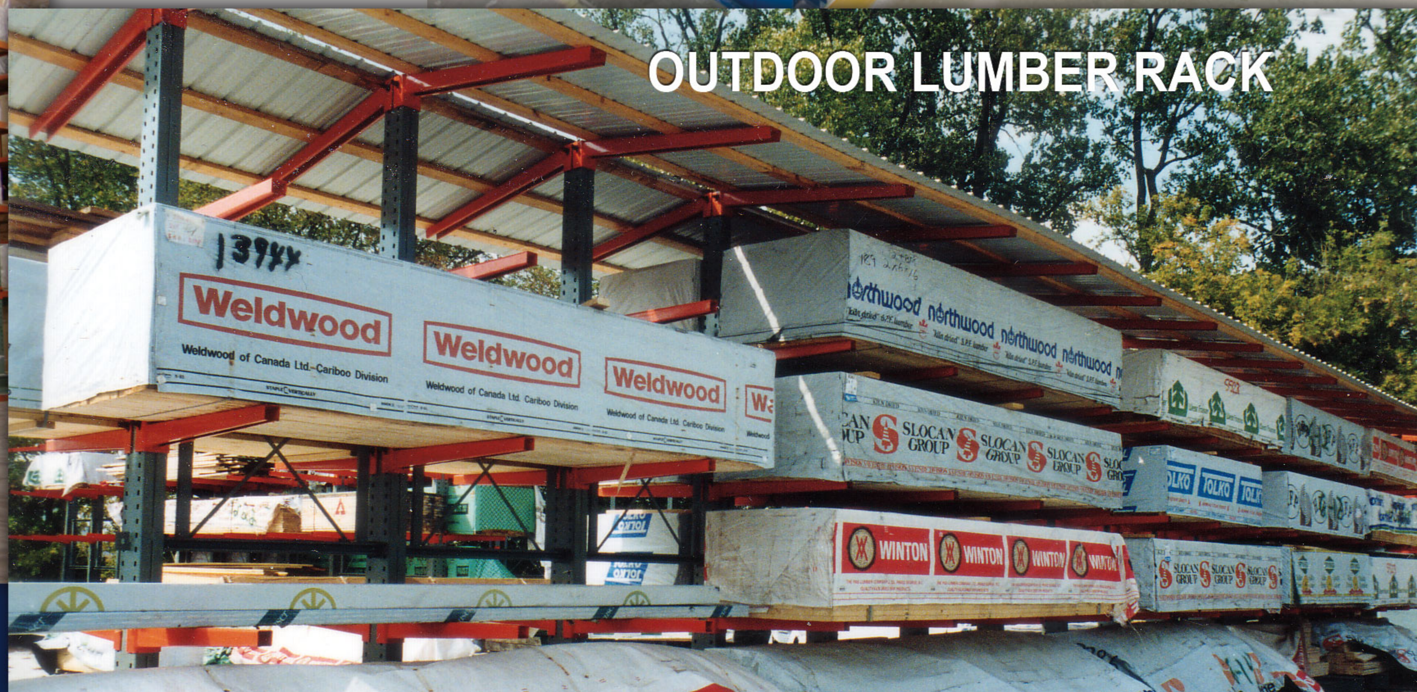
OUTDOOR LUMBER RACK

Furniture items, such as sofas, can be easily removed with no frontal obstructions to damage product